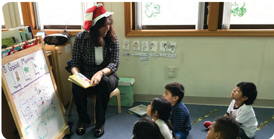
Read Across America Day 2018 with NYS Senator Sue Serino reading to students at Astor Head Start in Wappingers Falls

Because United, we stand. United, we move through. Above. And beyond.